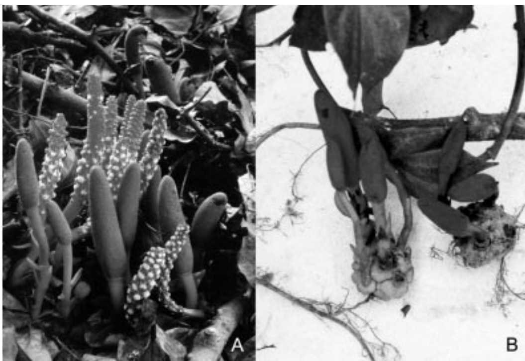
FIGURE 2. Colony of Balanophora hongkongensis K. M. Lau, N. H. Li & S. Y. Hu. A, staminate and carpellate plants in natural habitat; B, Two carpellate plants of Balanophora hongkongensis parasitic on roots of Bauhinia championii .